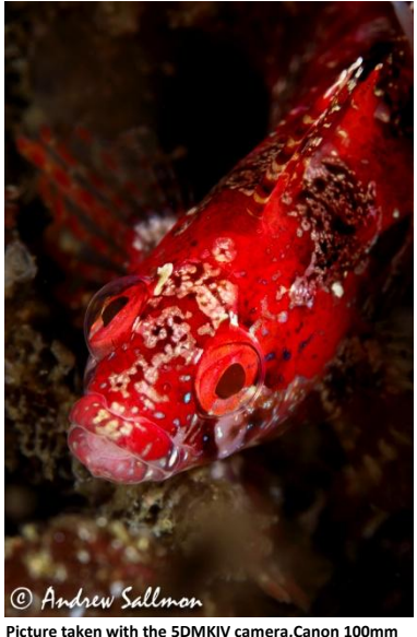
Picture taken with the 5DMKIV camera, Canon 100mm f2.8L IS macro lens behind an Aquatica Mini Macro Port with an ACU5 close up lens and flip holder system.