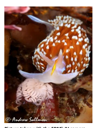
Picture taken with the 5DMk IV camera, theCanon 100 f2.8L IS behind the Aquatica 4" mini dome

All Aquatica housingsare constructed from the finest material available in the industry. They are carefully crafted from a selected alloy of aircraft grade aluminum and a premium grade of stainless steel, the housing shell is machined using the latest 5 axis computer assisted machines. After undergoing a series of quality control operations, the main body and its controls knobs will get protection by anodizing them to North American military specifications, furthermore, a coating of "tough as nail" powder coating is baked on at a high temperature. Corrosion inhibiting zinc anodes are standard equipment on all of our housings. These extra levels of protection are apparent, even with over 1,500 dives on them, still look as fresh as the day they came out of the box.