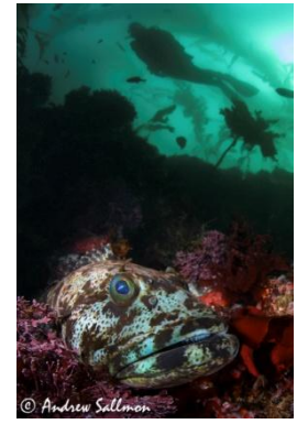
Picture taken with the 5D Mk IV camera, Canon 8-15 f4L Fisheye Zoom lens behind the Aquatica 4" mini

A control extender armfor the ISO button is now a standard feature on the Aquatica A5DMk IV Pro Housing. ISO is an important, and in our opinion a vital feature, especially when shooting video, in normal circumstances this can be done by pushing on the ISO button located on the right hand top of the housing. This lever gives a quickand comfortable access to the ISO control of the camera.