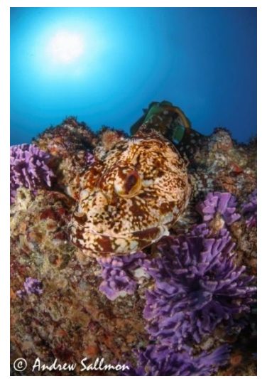
Picture taken with the 5D Mk IV camera, 8-15 f4L Fisheye Lens behind the Aquatica 9.25" Mega glass