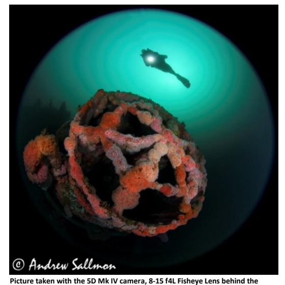
Aquatica 4" mini dome

***We will soon have the port extension and zoom gear to support the new Canon 16-35mm f/2.8L III USM as well as the zoom gear, port extension and dome option for the EF 11-24mm f/4L USM Lens